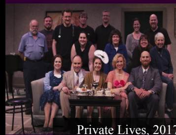
Private Lives, 2017

Volunteers are at the forefront of our organization. Without them, cwACT would cease to exist. Our volunteers have diverse backgrounds – come arrive without experience, while others have theater degrees. No matter,