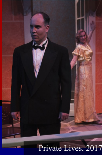
Private Lives, 2017

In the upside-down world of the Addams Family, to be sad is to be happy, to feel pain is to feel joy, and death and suffering are the stuff of their dreams. However, they still have to deal with the same challenge faced by any other family: the kids growing up. In one fateful, hilarious night, when Wednesday invites her boyfriend's sweet, kind family over for dinner, secrets are disclosed, relationships are tested, and the Addams family must face the one horrible thing they've managed to avoid for generations: change.